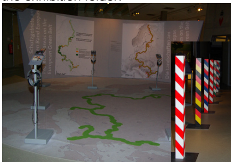
Parts of the European Green Belt exhibition, Linz, Austria

Bring this successful exhibition to your town! The exhibition "The European Green Belt: Borders. Wilderness. Future" was shown to great public and media acclaim (approx. 90,000 visitors) for six months at Schlossmuseum Linz. After the end of the exhibition in January 2010, the developers of University of Vienna offer the modular exhibits for display in other parts of Europe. If you are interested in more details, please contact Katharina Zmelik to receive the exhibition folder.