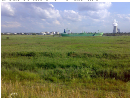
Area bordering the Rostock harbour

end, an area of 4,4 ha in the estuary of Peetzer stream was declared. Even though, this area is not large in total, this is a meaningful achievement, as this area is located right next to other areas suitable for renaturation.